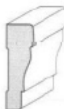
Standard Casing 11/16 x 2-1/4