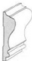
2-5/8" Chair Rail