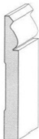
Upgrade Base 9/16 x 5-1/4